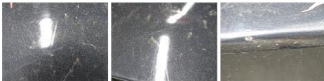
Door R L, Scratch(es), LI - Repair and paint (complete)