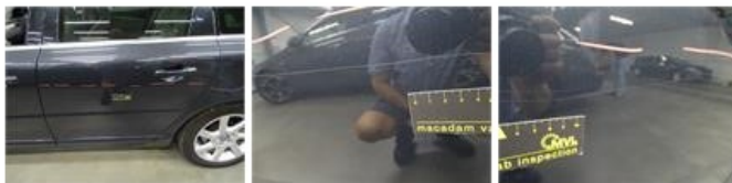
Wing R L, Scratch(es), LI - Repair and paint (complete)