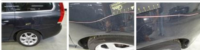
Alloy rim R L, Scratch(es), Acceptable