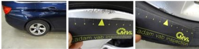
Door F R, Scratch(es), Acceptable