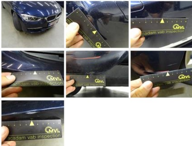
Door R R, Dent(s) and scratch(es), LI - Repair and paint (complete)