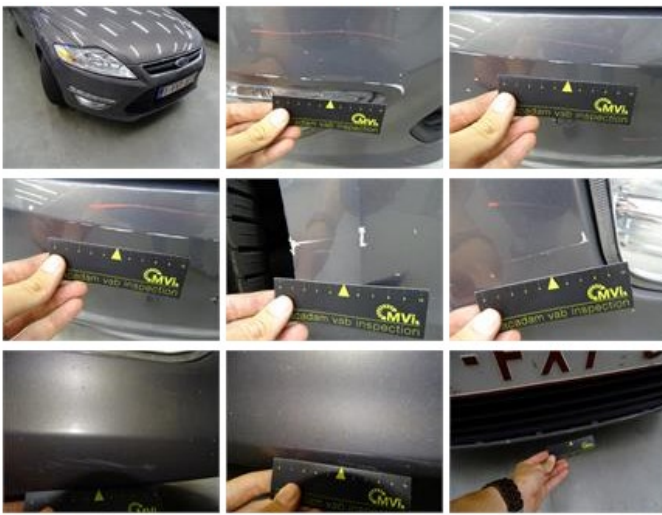
Door R L, Scratch(es), LI - Repair and paint (complete)