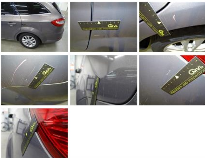
Roof, Chemical pollution, LI - Repair and paint (complete)