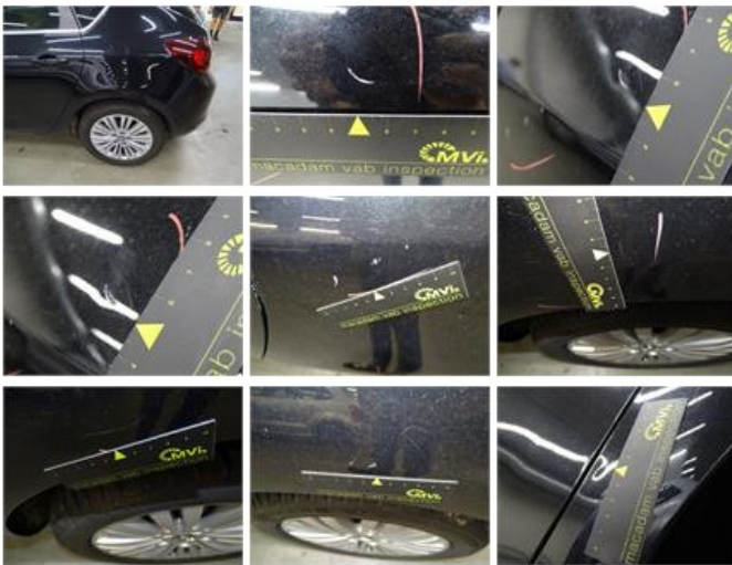
Rear spoiler, Chemical pollution, LI - Repair and paint (complete) 115,56