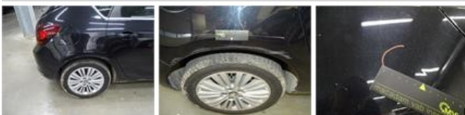
Door F L, Scratch(es), LI - Repair and paint (complete) 318,35