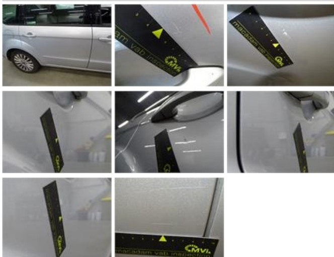
Door F R, Scratch(es), Acceptable