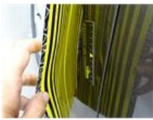
Floor covering F L, Hole, E - Replace