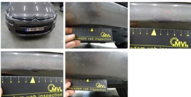
Wing R L, Scratch(es), LI - Repair and paint (complete)