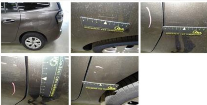
Rocker panel inner R L, Dent(s), LI - Repair and paint (complete)