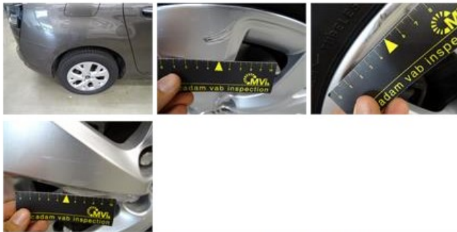
Rocker panel inner R R, Dent(s), LI - Repair and paint (complete)