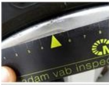
Bonnet, Bad repair, Acceptable