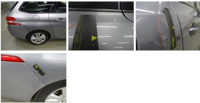
Roof, Dent(s), Acceptable