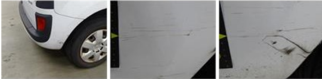
Sliding door R, Scratch(es), It - Spot repair