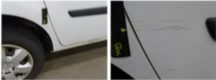
Wheel cover F L, Missing, E - Replace