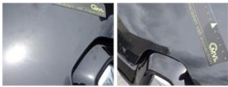
Wheel cover F L, Scratch(es), E - Replace