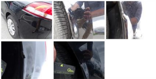
Door F L, Scratch(es), Acceptable