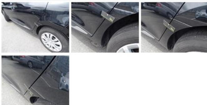
Door F R, Scratch(es), Acceptable