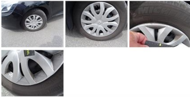
Wheel cover R L, Scratch(es), E - Replace