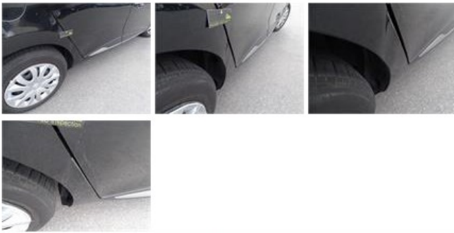
Door R L, Dent(s) and scratch(es), LI - Repair and paint (complete)