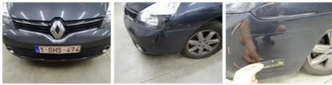
Wing F L, Scratch(es), LI - Repair and paint (complete)