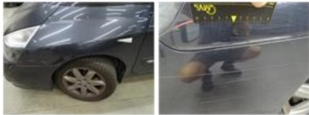
Door F L, Scratch(es), Acceptable