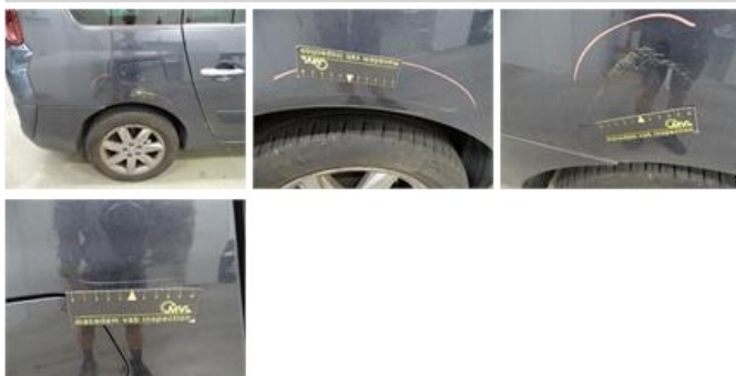
Door F R, Dent(s) and scratch(es), LI - Repair and paint (complete)