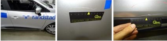
Door F L, Scratch(es), Acceptable