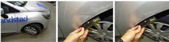
Wheel cover R L, Scratch(es), E - Replace 24,00