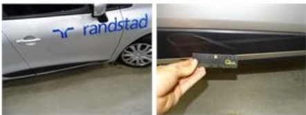
Wing F R, Scratch(es), LI - Repair and paint (complete) 176,14