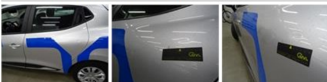
Bumper R, Scratch(es), LI - Repair and paint (complete) 169,44