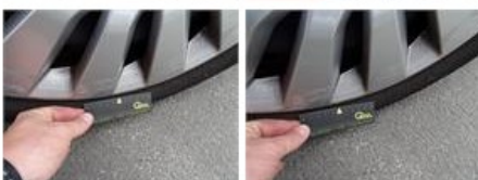
Maintenance - Maintenance - Execute