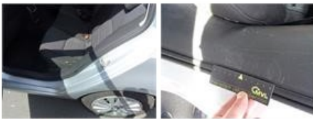
Mats, Missing, E - Replace