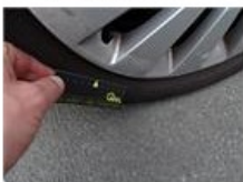
Wheel cover F R, Scratch(es), E - Replace