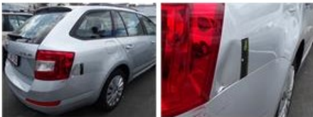
Wheel cover F L, Scratch(es), E - Replace