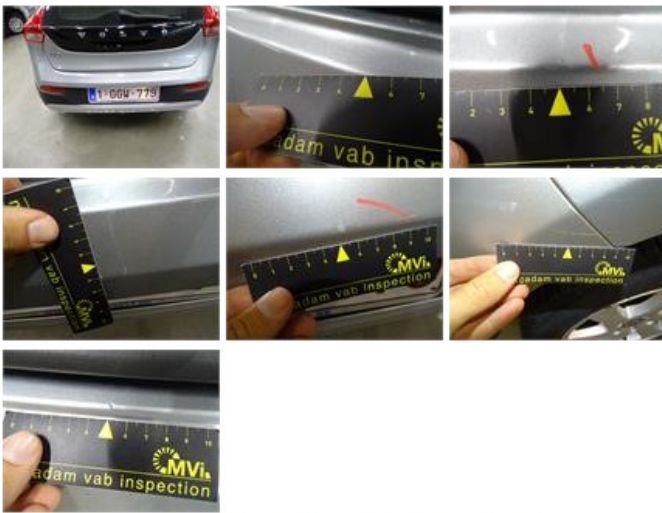
Door R L, Dent(s) and scratch(es), LI - Repair and paint (complete) 318,35