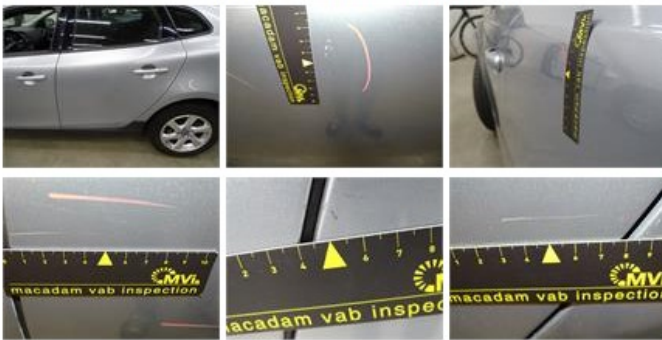
Door F L, Dent(s) and scratch(es), LI - Repair and paint (complete) 318,35