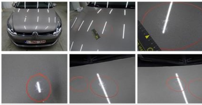
Bumper F, Dent(s) and scratch(es), LI - Repair and paint (complete)