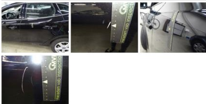
Door F R, Dent(s) and scratch(es), LI - Repair and paint (complete)