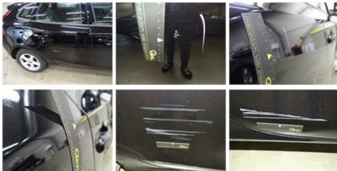
Wing R R, Scratch(es), Acceptable