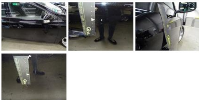
Bonnet, Chemical solution, LI - Repair and paint (complete)