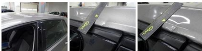
Door frame F L, Dent(s), It - Spot repair