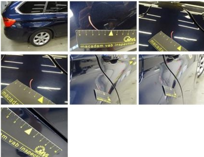
Door R L, Scratch(es), Acceptable