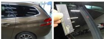
Door R R, Bad repair, Acceptable