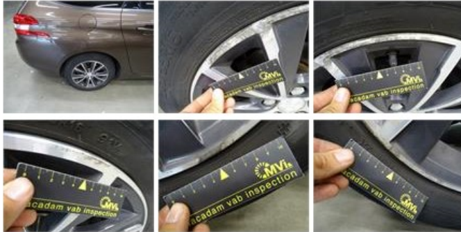
Alloy rim F L polished, Scratch(es), LI - Repair and paint (complete)