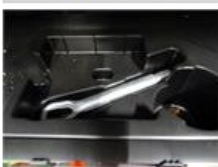
Bonnet, Chemical pollution, LI - Repair and paint (complete)