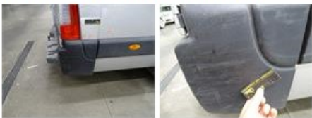
Bumper F, Deformed / Strained, E - Replace