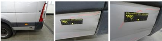
Trunk door R R, Dent(s) and scratch(es), It - Spot repair