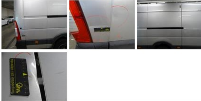
Wing trim R L, Broken, E - Replace