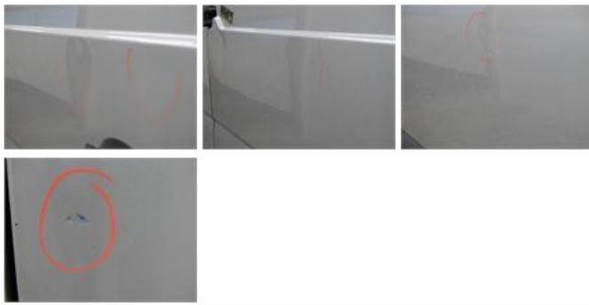
Wing R R, Dent(s) and scratch(es), LI - Repair and paint (complete)