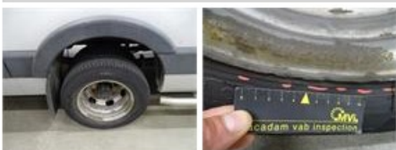
Wheel cover F R, Broken, E - Replace