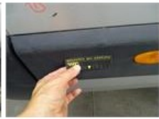
Door F L, Dent(s) and scratch(es), LI - Repair and paint (complete)