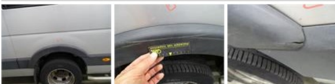
Wing trim R R, Scratch(es), E - Replace