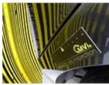
Wing F L, Dent(s), PDR - Paintless dent repair