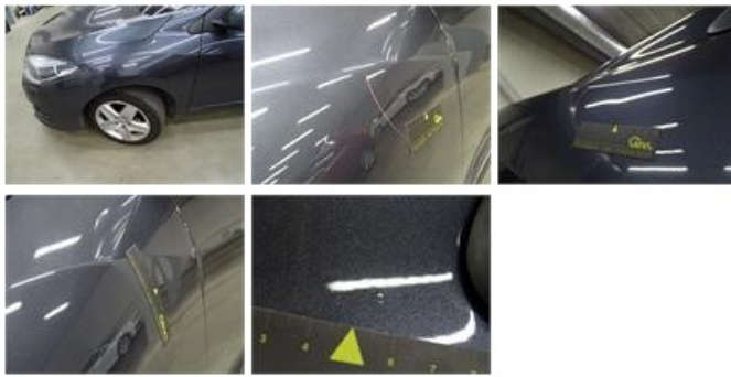
Door F R, Bad repair, Acceptable