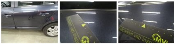
Door frame R L, Dent(s), It - Spot repair