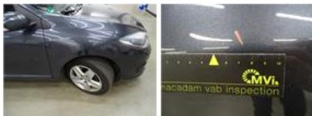
Bumper corner R R, Scratch(es), Acceptable