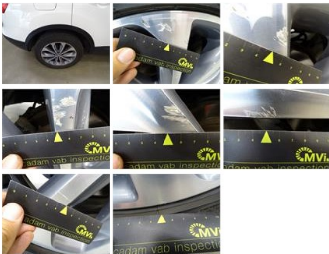
Alloy rim F R polished, Scratch(es), LI - Repair and paint (complete)