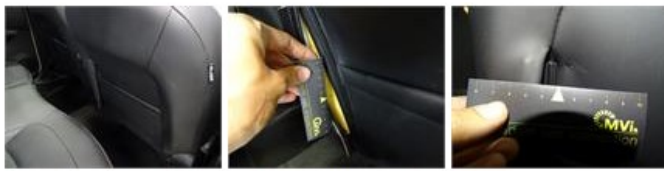
Protection plate M, Deformed / Strained, E - Replace