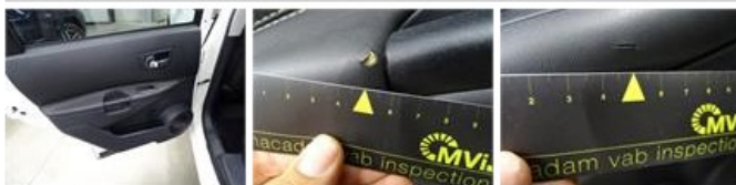
Door F L, Scratch(es), Acceptable