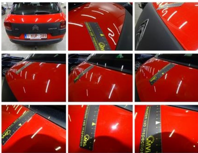
Wing R R, Dent(s), PDR - Paintless dent repair