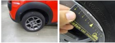
Wing moulding F L, Scratch(es), E - Replace