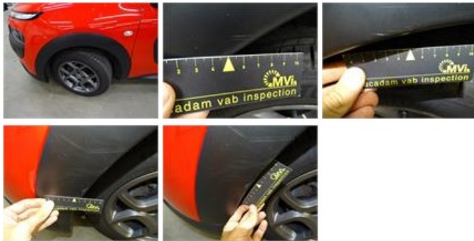
Wing F R, Scratch(es), Acceptable