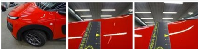
Wing moulding F R, Scratch(es), E - Replace