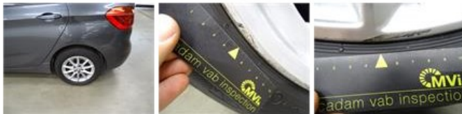
Bumper R, Scratch(es), LI - Repair and paint (complete)