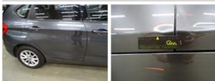
Wing F L, Chemical polution, LI - Repair and paint (complete)