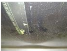
Wing F R, Scratch(es), Acceptable