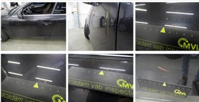
Wing F L, Scratch(es), LI - Repair and paint (complete)