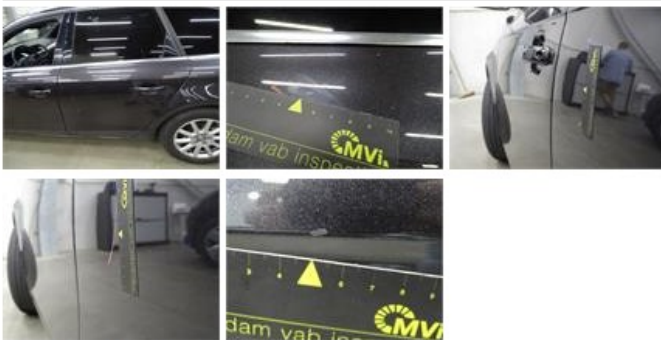
Door F L, Bad repair, Acceptable