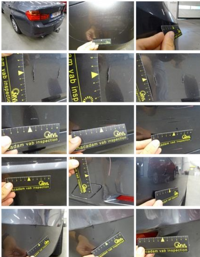
Wing R L, Dent(s) and scratch(es), LI - Repair and paint (complete)