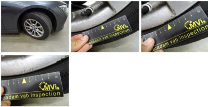
Door R R, Dent(s) and scratch(es), LI - Repair and paint (complete)