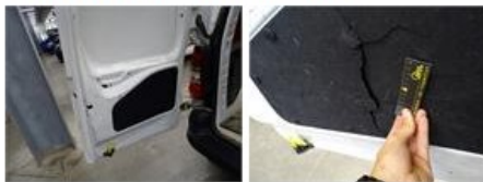
Wing trim R L, Scratch(es), E - Replace