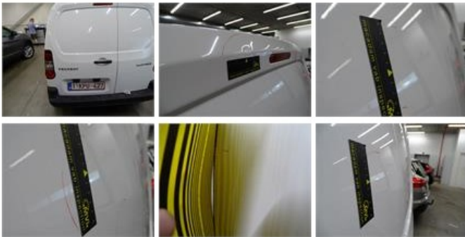
Trunk door R R, Dent(s) and scratch(es), It - Spot repair