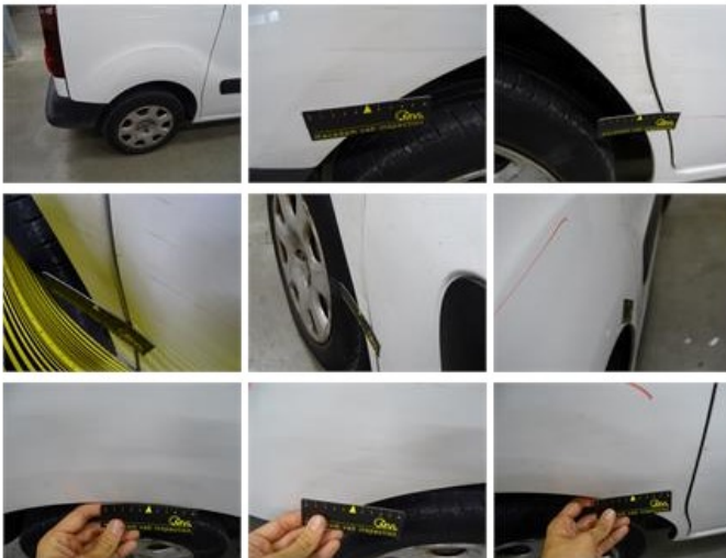
Bodywork, Glue residues, Acceptable