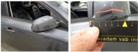
Wing F L, Scratch(es), LI - Repair and paint (complete) 220,18