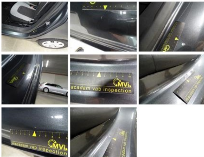
Floor covering F L, Hole, Smart repair