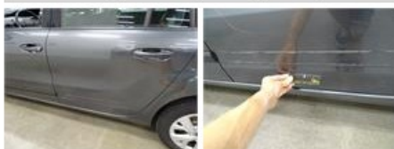
Rocker panel inner R R, Dent(s), Acceptable