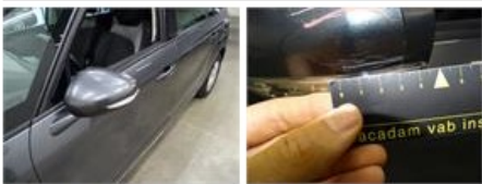
Door F R, Scratch(es), Acceptable 0,00