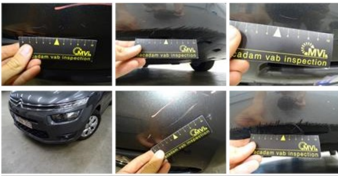
Bumper R, Scratch(es), LI - Repair and paint (complete) 211,80