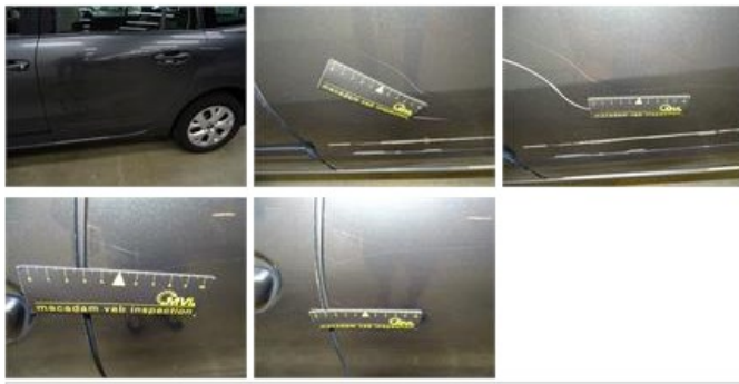
Bonnet, Scratch(es), LI - Repair and paint (complete)