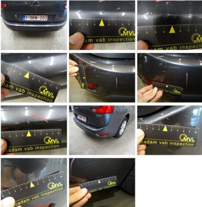
Rearview mirror housing L, Scratch(es), LI - Repair and paint (complete) 115,56