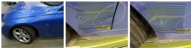
Bumper R, Scratch(es), Acceptable