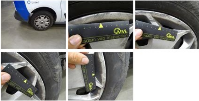
Wing R R, Scratch(es), Acceptable