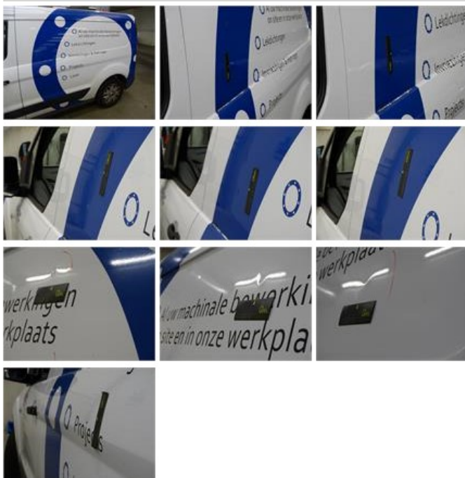
Door R R, Scratch(es), Acceptable