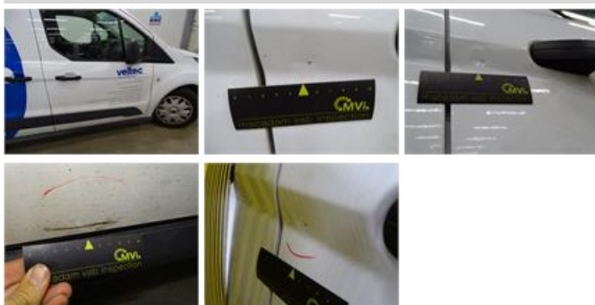
Trunk door R R, Dent(s) and scratch(es), Acceptable