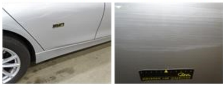
Wing R R, Scratch(es), LI - Repair and paint (complete)