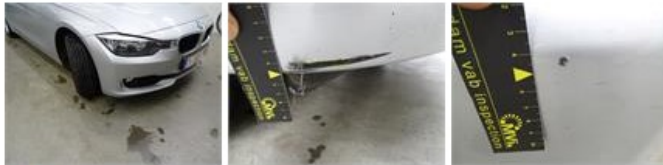
Sill outer L, Scratch(es), Acceptable