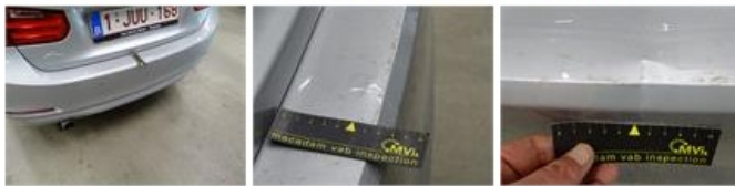
Bumper F, Scratch(es), LI - Repair and paint (complete)