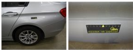
Door R R, Scratch(es), LI - Repair and paint (complete)