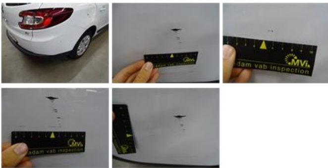
Wing R L, Dent(s) and scratch(es), LI - Repair and paint (complete)