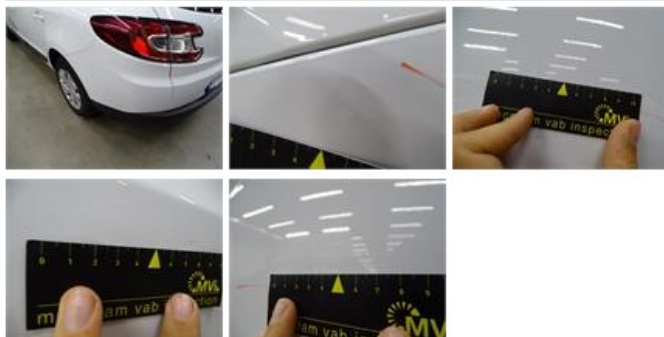
Door moulding Lower F R, Scratch(es), Acceptable