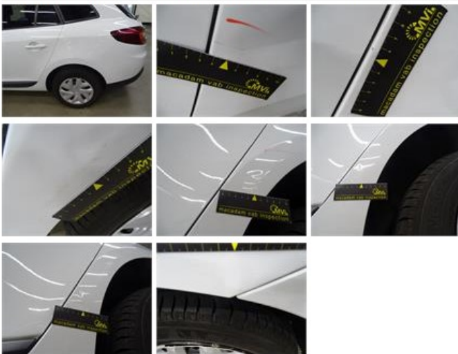
Door F R, Dent(s) and scratch(es), LI - Repair and paint (complete)