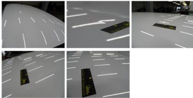
Trunk lid covering R, Scratch(es), Smart repair