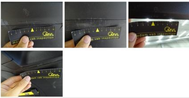
Bumper R, Scratch(es), LI - Repair and paint (complete)