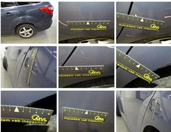
A-pillar right, Scratch(es), LI - Repair and paint (complete)