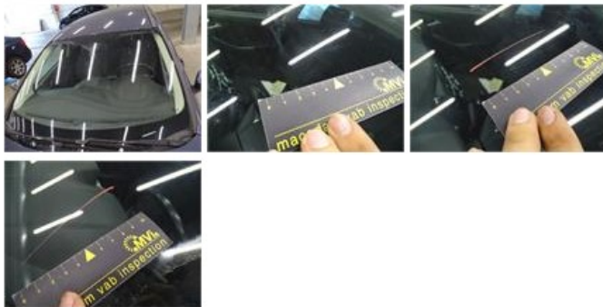
Tailgate, Crack, Le - Replace and paint