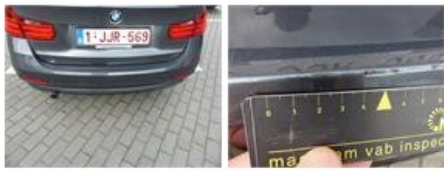
Wing F L, Dent(s) and scratch(es), Acceptable