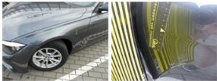
Wing F R, Repaired, No repair