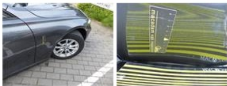
Wing R R, Dent(s), Acceptable