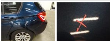
Door R R, Scratch(es), 67 - Polish