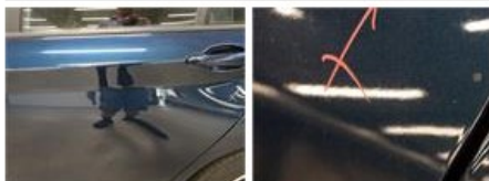
Wing R R, Dent(s), Acceptable