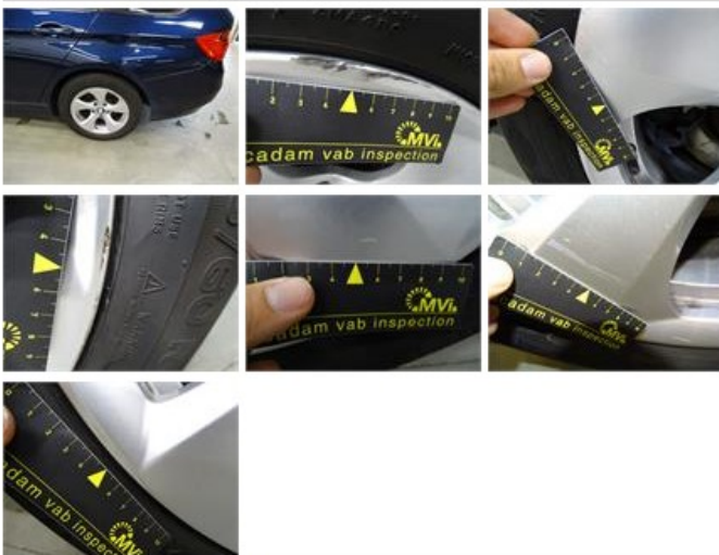
Door F R, Repaired, Acceptable