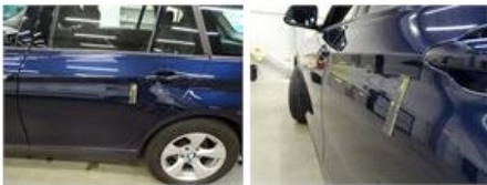
Door R R, Repaired, Acceptable