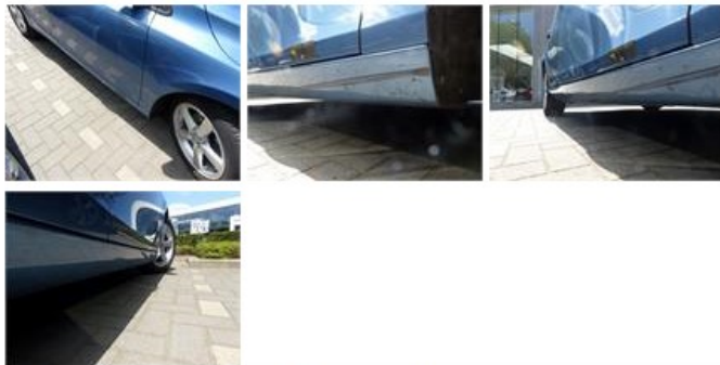
Rocker panel inner R R, Scratch(es), Acceptable