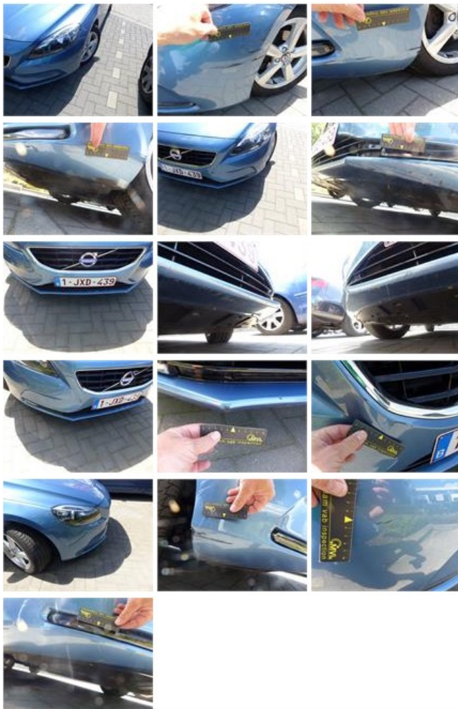
Sill outer R, Scratch(es), LI - Repair and paint (complete)