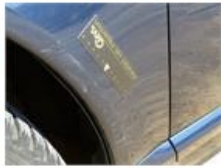
Door F L, Scratch(es), Acceptable