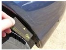
Wing R R, Bad repair, LI - Repair and paint (complete)