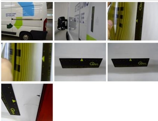
Roof pillar R, Scratch(es), Acceptable