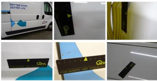
Wing R R, Dent(s), LI - Repair and paint (complete)