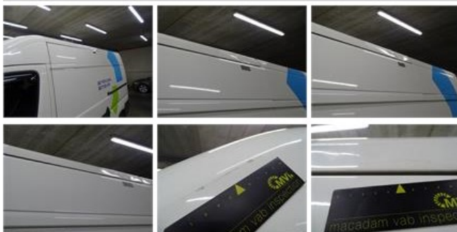
Central pillar R, Scratch(es), Acceptable