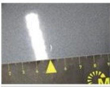
Alloy rim R L, Scratch(es), Acceptable