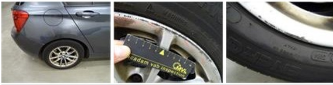
Alloy rim F L, Scratch(es), LI - Repair and paint (complete)