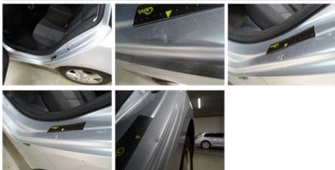
Sill outer R, Dent(s) and scratch(es), LI - Repair and paint (complete)