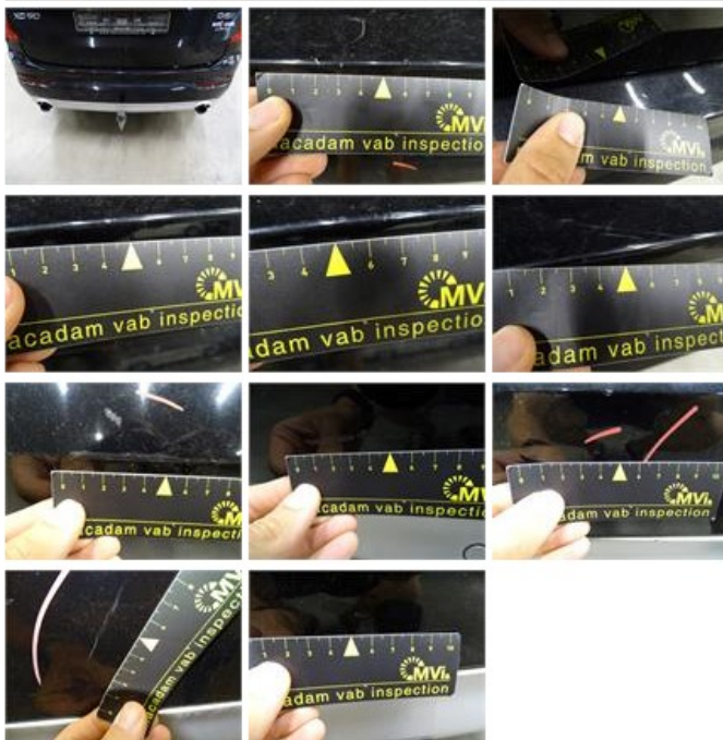
Wing moulding F R, Scratch(es), Acceptable