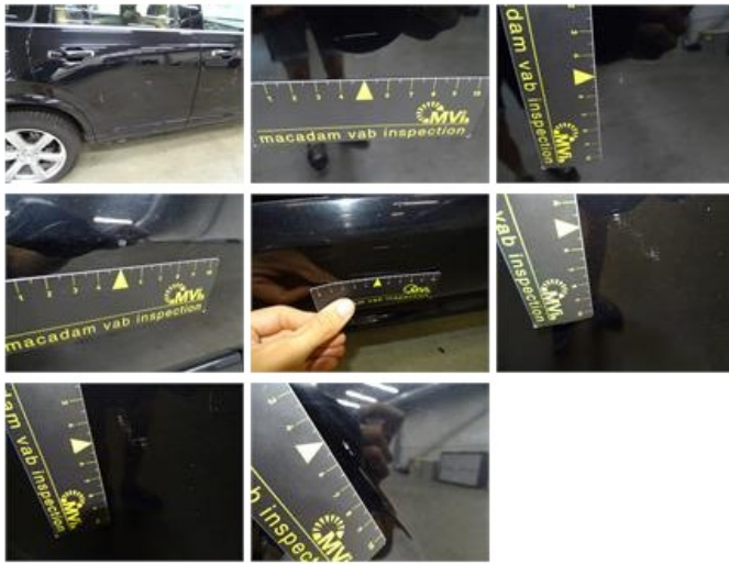
Bumper F, Scratch(es), Acceptable