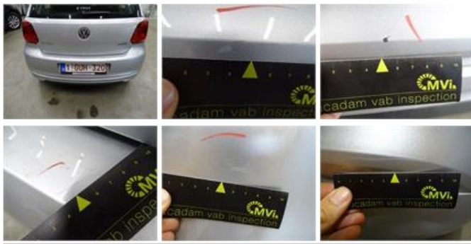
Windscreen, Scratch(es), Acceptable