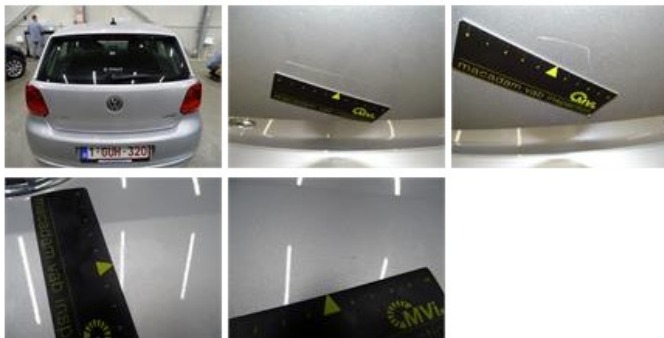
Door F L, Scratch(es), Acceptable