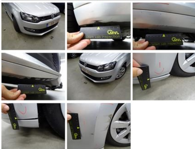
Wing F R, Scratch(es), Acceptable