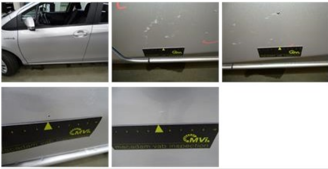
Bumper R, Scratch(es), LI - Repair and paint (complete)