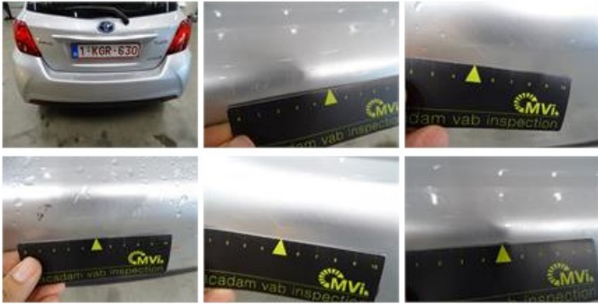
Wing F L, Dent(s) and scratch(es), LI - Repair and paint (complete)