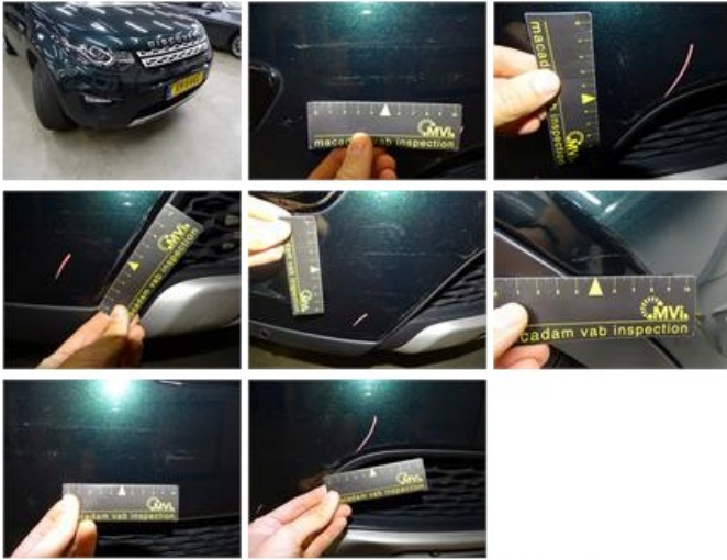
Door F L, Dent(s) and scratch(es), LI - Repair and paint (complete)