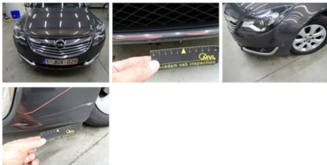
Door F R, Dent(s) and scratch(es), LI - Repair and paint (complete)