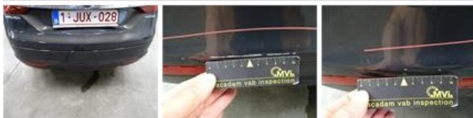
Door R L, Dent(s), LI - Repair and paint (complete)