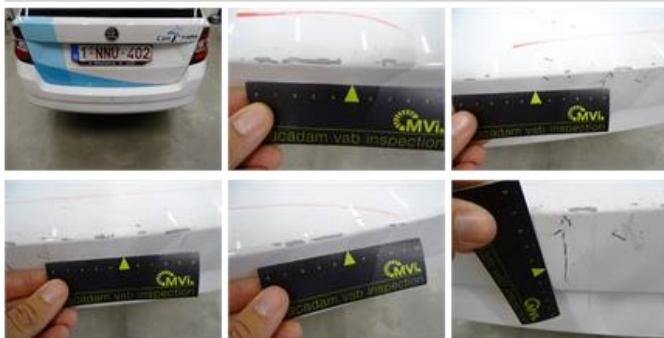
Roof, Dent(s), PDR - Paintless dent repair