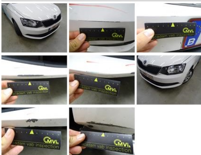
Floor covering F R, Hole, Smart repair