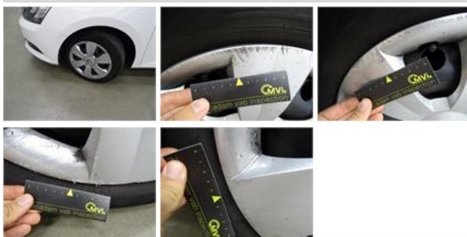
Wheel cover R R, Scratch(es), Acceptable