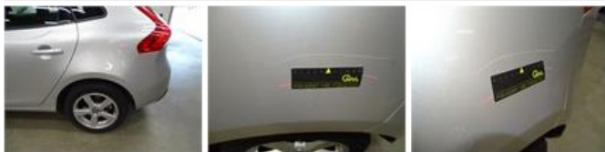
Bumper F, Bad repair, Acceptable