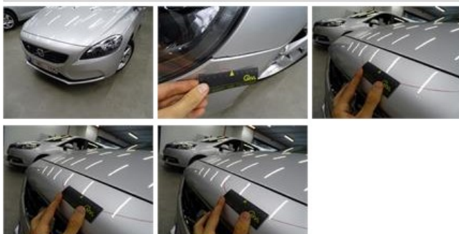
Sill outer L, Deformed / Strained, Acceptable